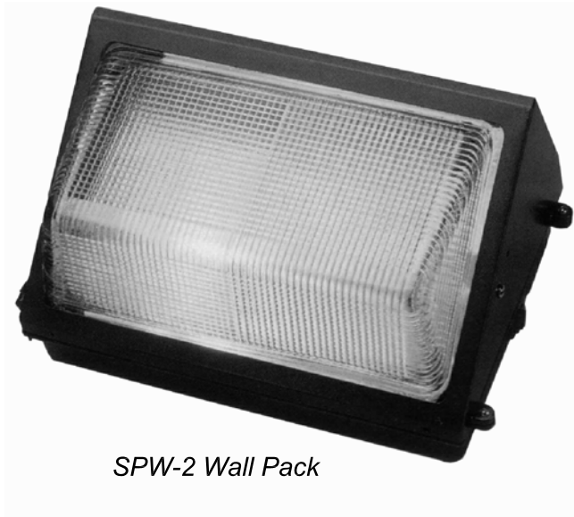
SPW-2 Wall Pack

SPW Wall Packs align with all standard recessed outlet boxes. Die-cast aluminum housing finished in powder coated architectural bronze. Borosilicate glass or molded polycarbonate prismatic lens. Weather-tight seal between housing and lens frame.