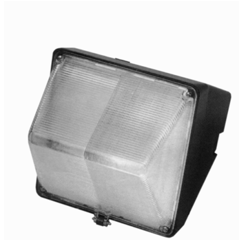
SPW-1 Small Wall Pack